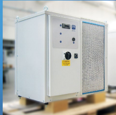
Hydraulic oil cooler with customised frame, nominal cooling capacity 5 kW.