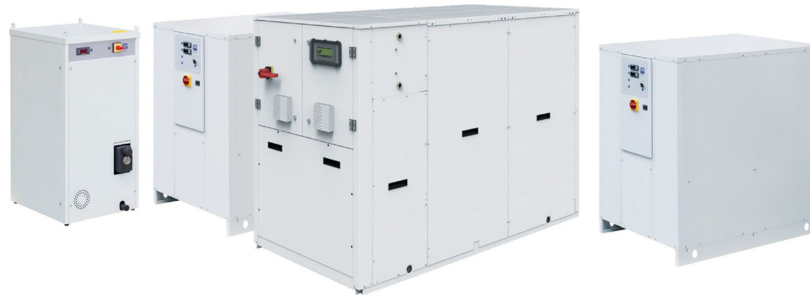
SCW Water/water exchangers from 3,5 to 82 kW