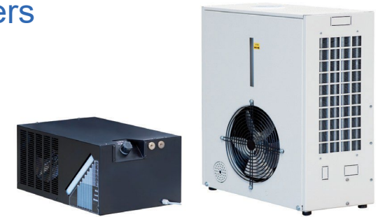
AWEX Air/water heat exchangers from 1 to 3,5 kW