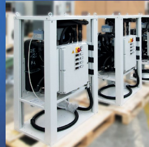
Multi-circuit exchanger for cooling three secondary liquids with customised frame, nominal cooling capacity 15 kW.