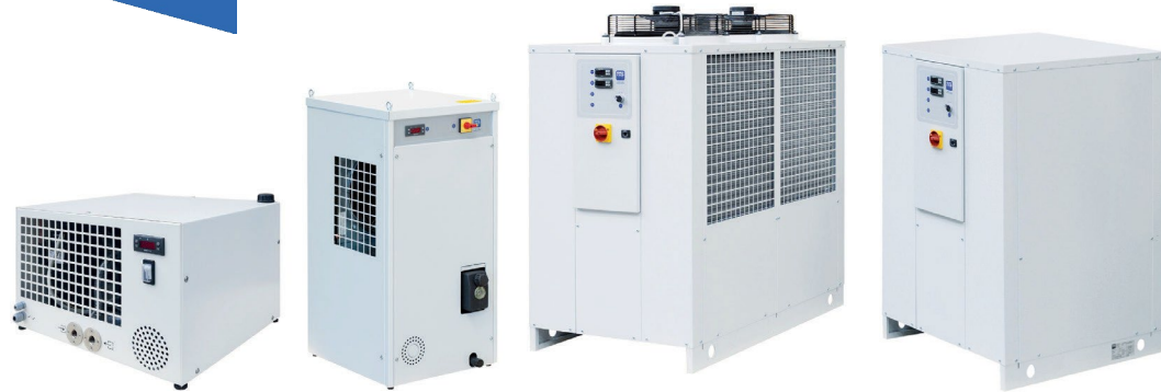
ACW Air condensed water chillers from 2 to 200 kW